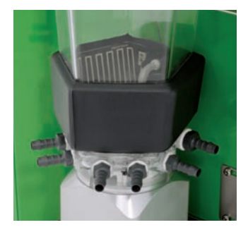
Mixer heating system available as an accessory

The boiler, which has a temperature sensor, an electronic heating regulator and a minimum temperature monitor, ensures that the feed always has the right temperature, and can be easily configured and checked.