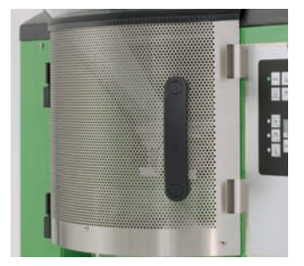
Optional fly protection screen

The fine-pored fly screen for the mixer prevents flies from getting into the feeding box. Steam that arises in the feeding box can easily escape because of the large size of the box and through the pores; condensation water is easily prevented this way.